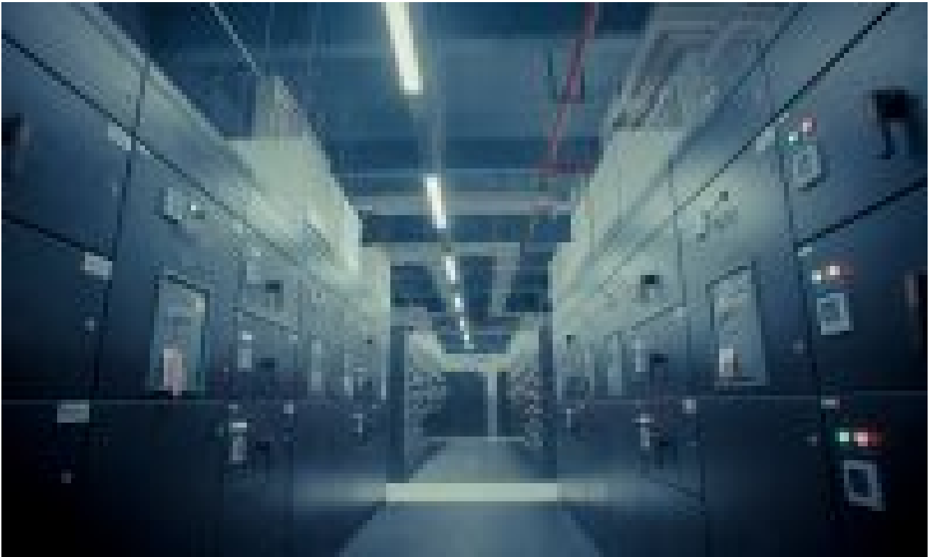
Telia Carrier to deploy across ALL EdgeConneX data centres worldwide ( https://data-economy.com/telia-carrier-deploy-across-edgeconnex-data-centres-worldwide/ )

Data Economy Blogs ( https://data-economy.com/tag/blog/ ) Datacloud ( https://data-economy.com/tag/datacloud/ ) Datacloud Europe ( https://data-economy.com/tag/datacloud-europe/ ) Europe ( https://data-economy.com/tag/europe/ ) Thought Leadership ( https://data-economy.com/tag/thought-leadership/ )