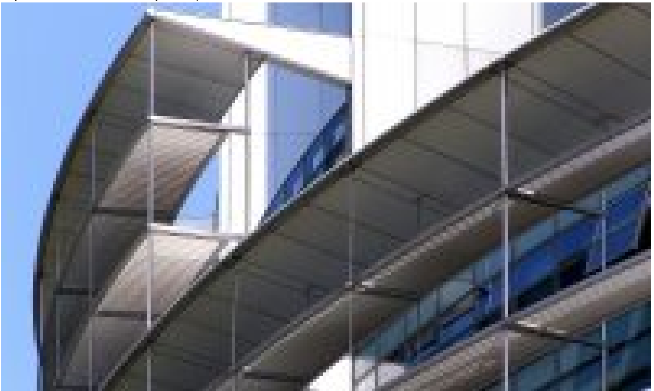
Oracle, Microsoft open government cloud zones ( https://data-economy.com/oracle-microsoft-open-government-cloud-zones/ )