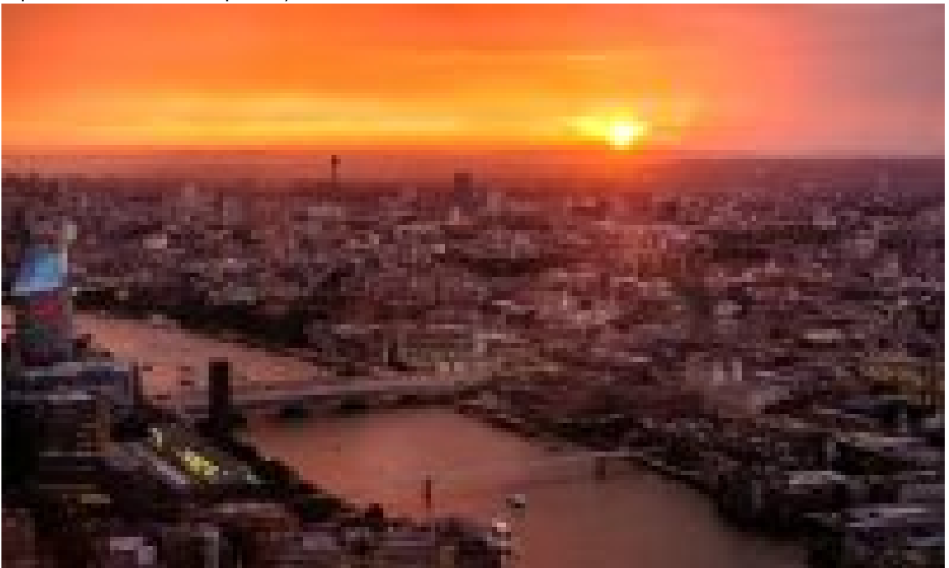
Google opens London cloud region in 'vote of confidence to the UK' ( https://data-economy.com/google-opens-london-cloud-region-vote-confidence-uk/ )