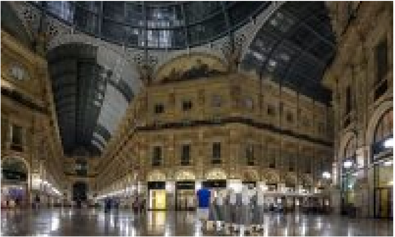
Italian data centre investment steps up in line with Milan's increased hub importance ( https://data-economy.com/italian-data-centre-investment-steps-line-milans-increased-hub-importance/ )