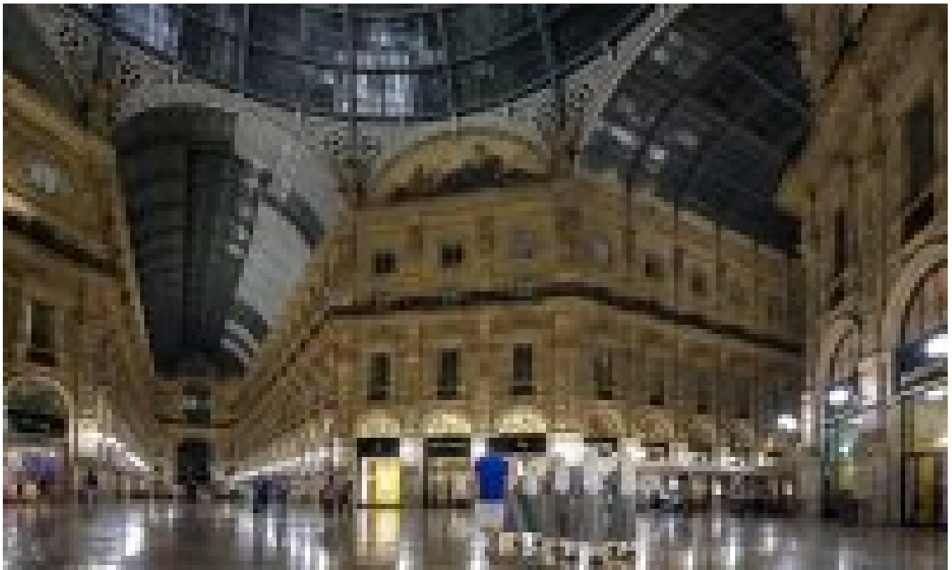
Italian data centre investment steps up in line with Milan's increased hub importance ( https://data-economy.com/italian-data-centre-investment-steps-line-milans-increased-hub-importance/ )